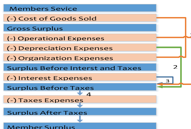
Figure 1: Stages of Cooperative Surplus Calculation

The amount of surplus distributed to the owner is highly dependent on several financial policies in the calculation of profit and loss or surplus in the cooperative. the surplus is obtained from the value of cooperative services minus basic expenses, resulting in gross surplus, minus operating expenses (including depreciation) and organization, resulting in business surplus, minus interest expense, resulting in a surplus before tax, then minus tax resulting in a net surplus which part will be distributed to members. The report on the calculation of cooperative surplus in stages is presented as Figure 1.